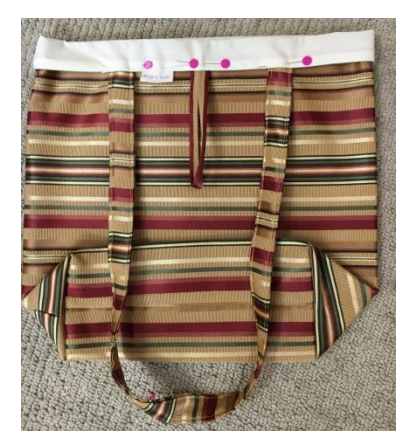
#8-10 Insert and pin straps, loop and label