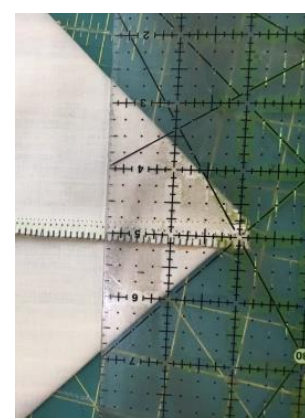
#5 2" from points