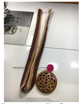
Button Loop Pin Stop