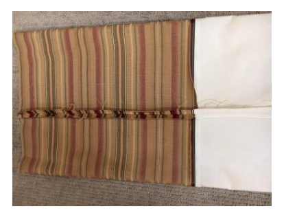
#3 RST Tube