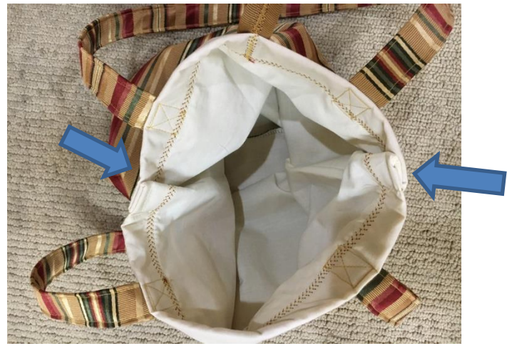
#13 Flip up button loop, close loop with zig zag up to the pin. #14 To shape purse, pinch 1" on side, sew