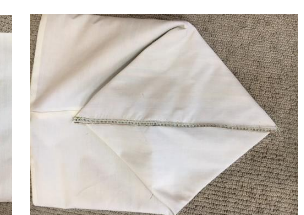
#5 Fold to line up seams