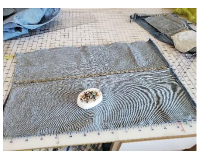
Step 6. Open up both pant legs, right sides together. Cut edges to straighten and align.