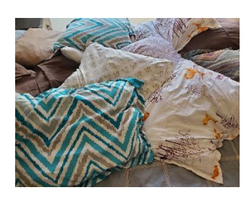
Zip Up or Sew Shut